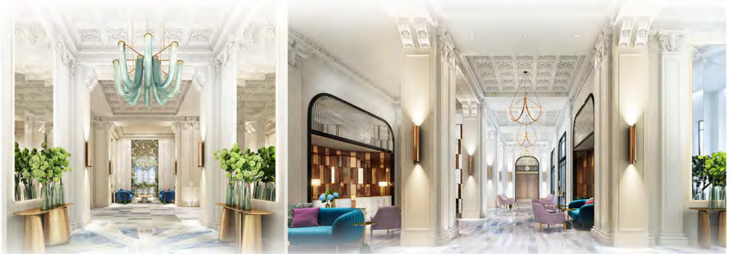
Breakers Hotel Entrance and Lobby Renderings

Design and finishes are subject to change